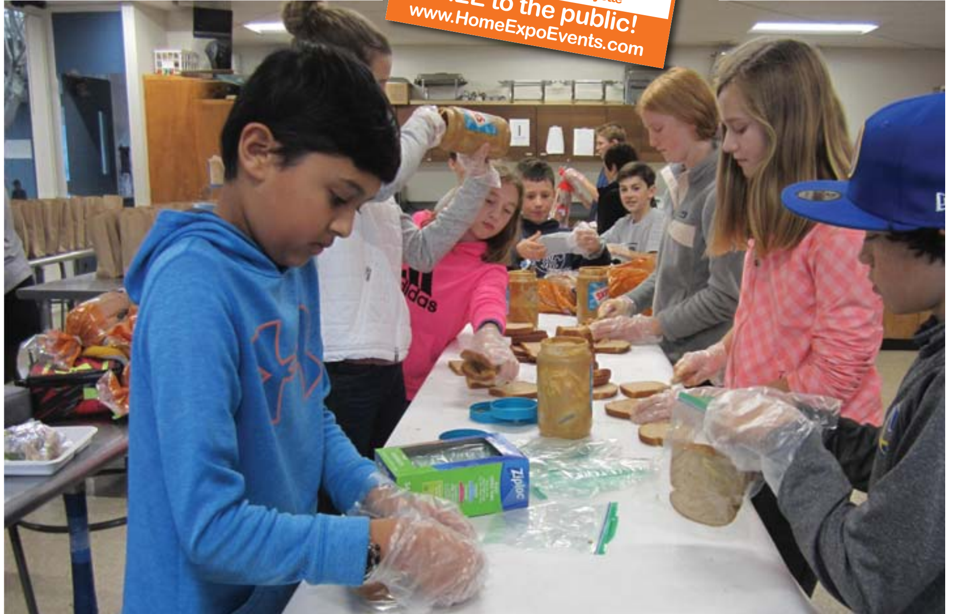
Peanut butter sandwich assembly line.